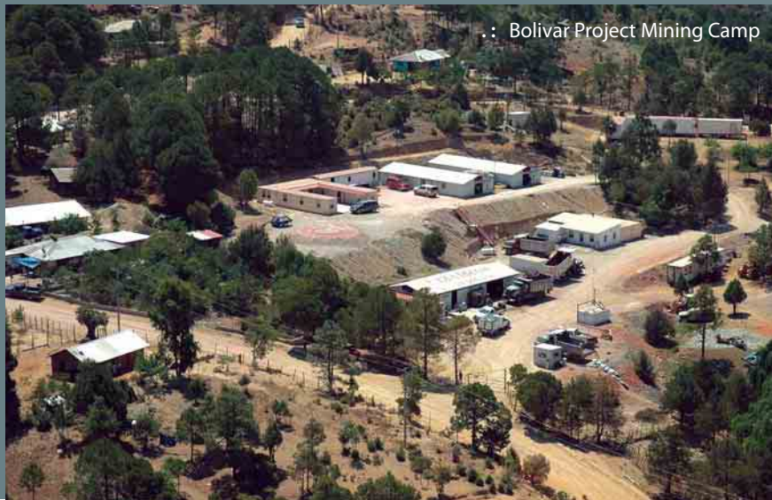
∴ Bolivar Project Mining Camp