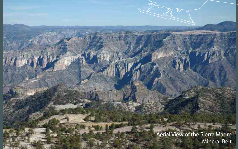
∴ Aerial View of the Sierra Madre Mineral Belt