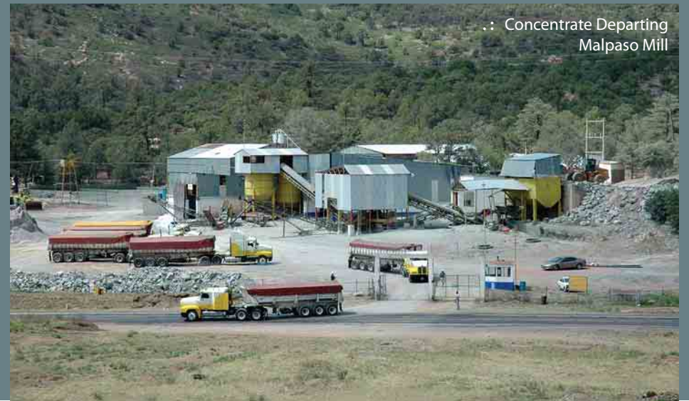
∴ Concentrate Departing Malpaso Mill